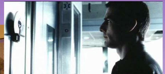
Minority Report (2002)

This course is designed to introduce students basic and relevant knowledge on selected technologies and technical gadgets described in films. A brief history and examples of modern technologies, such as electronics, microtechnology, and nanotechnology, will be concisely introduced. Principles and reality of selected technologies described in films will be reviewed and discussed including wearable electronics, telecommunication tools, robotic devices, and so on. Students are expected to discuss limitations and challenges of technologies shown in films. Throughout the course, students will gain knowledge on contemporary issues and prospects in electronics, microtechnology, and nanotechnology.